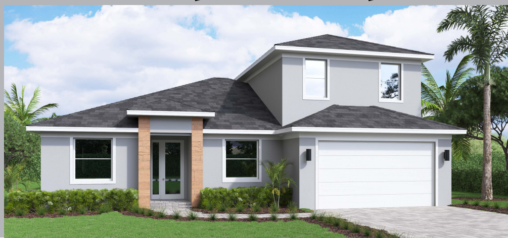
The Modern Elevation