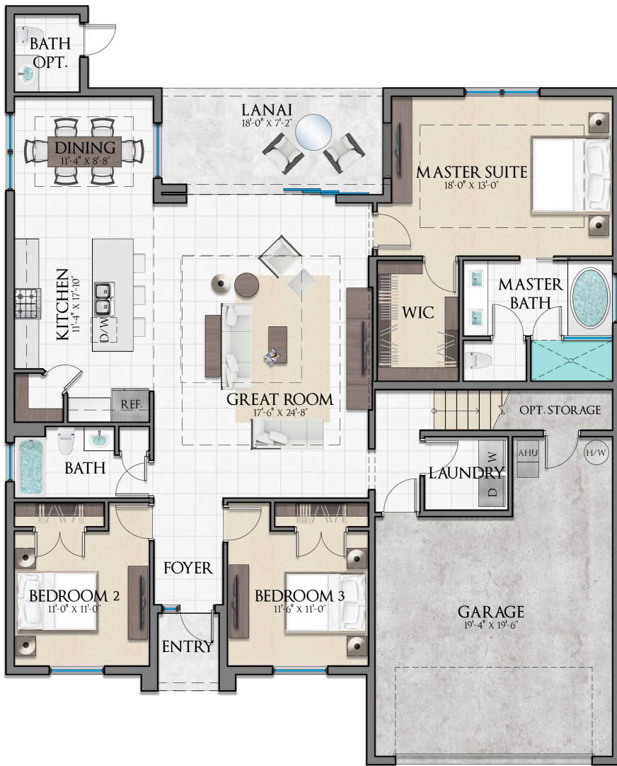
First Floor 1,931 sqft

City Water & Sewer Hookup Permit and Impact Fee Fill & Clearing