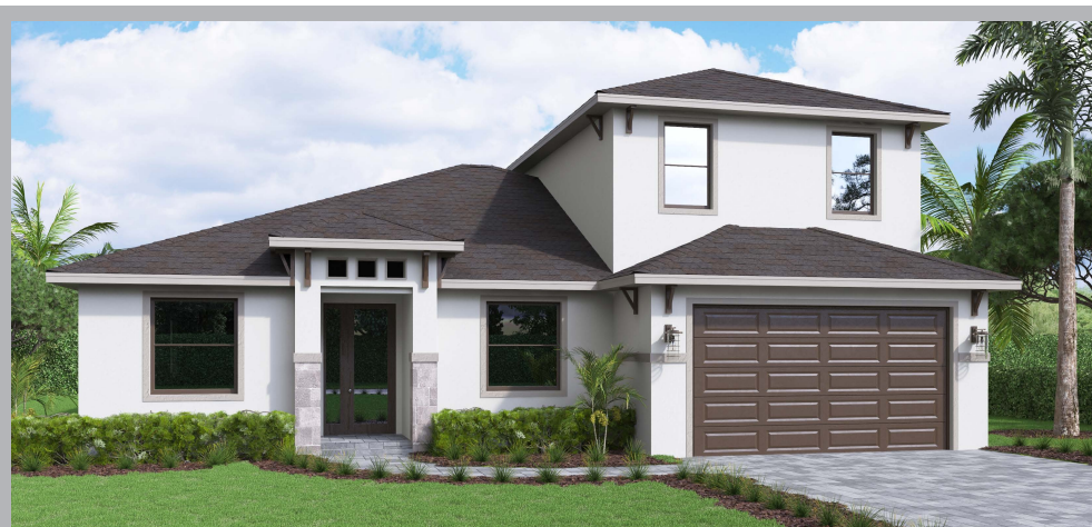
The Transitional Elevation

Color renderings are for artistic purpose only and do not necessarily represent actual design or color choices for home exterior. Artist's rendering subject to changes or refinement. Roof tile may vary. The square footage totals have been calculated using the engineering method (legal boundaries of the unit).