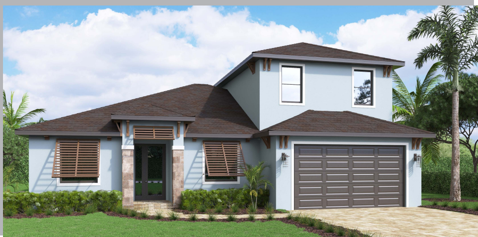
The Coastal Elevation